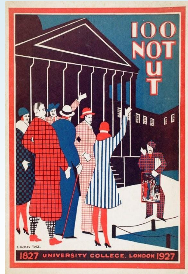
COLLEGE COLLECTION PERS The Centenary edition of the College Magazine, June 1927