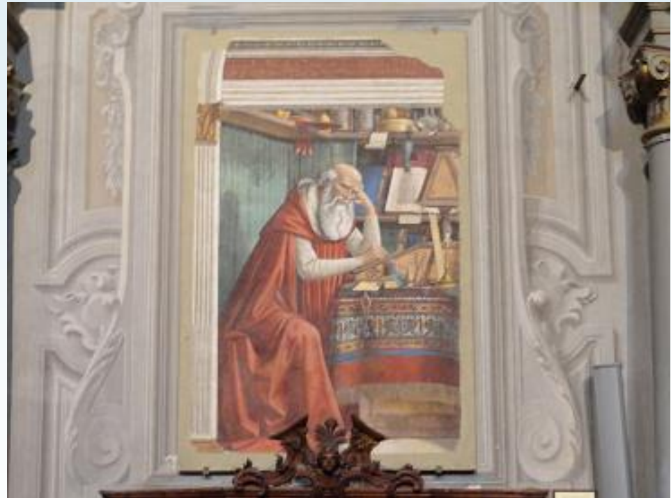
Saint Jerome in his Study, fresco by Domenico Ghirlandaio, 1480. Church of Ognissanti, Florence