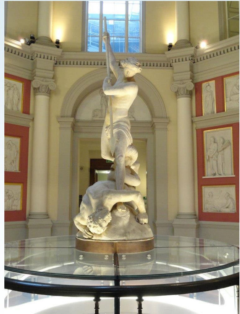
St Michael, by John Flaxman, UCL