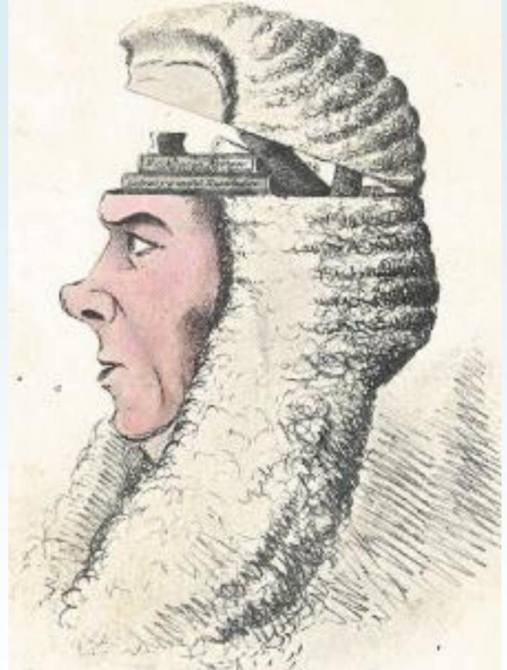
A Box of Useful Knowledge (Brougham Papers, UCL Library Services)