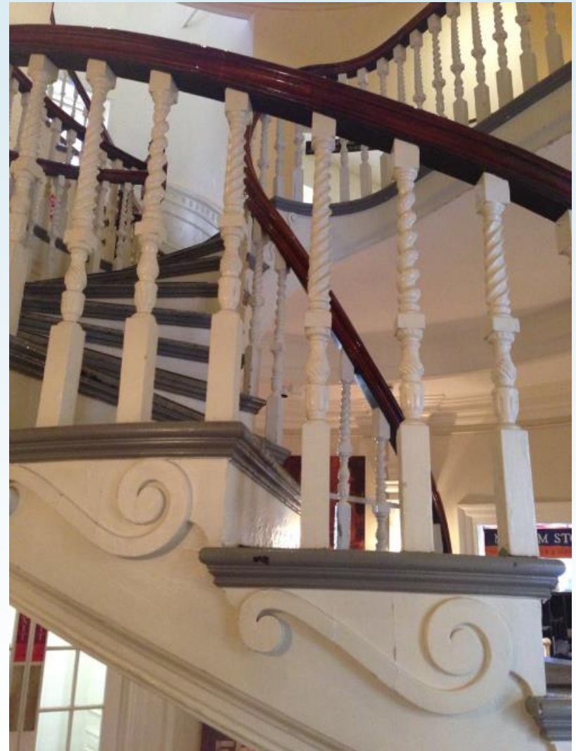
Old State House, Boston, USA