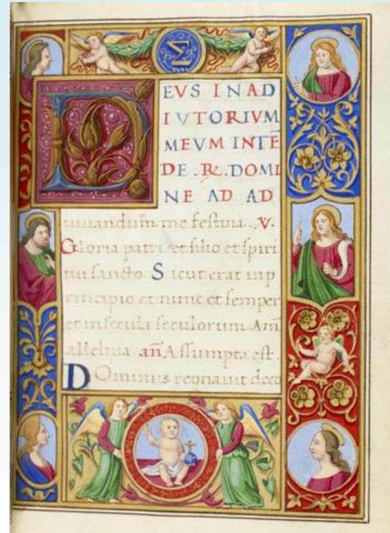
UCL Special Collections, 15 th century Book of Hours, with 19 th century additions. MS. Lat. 25